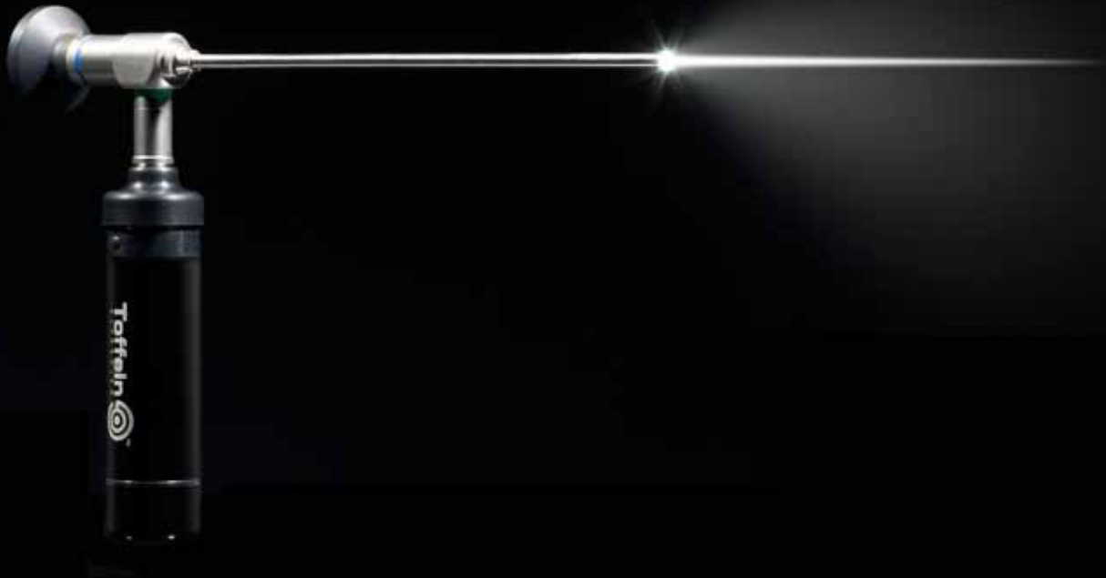
Toffeln UltraView Portable Light Source for Endoscopy